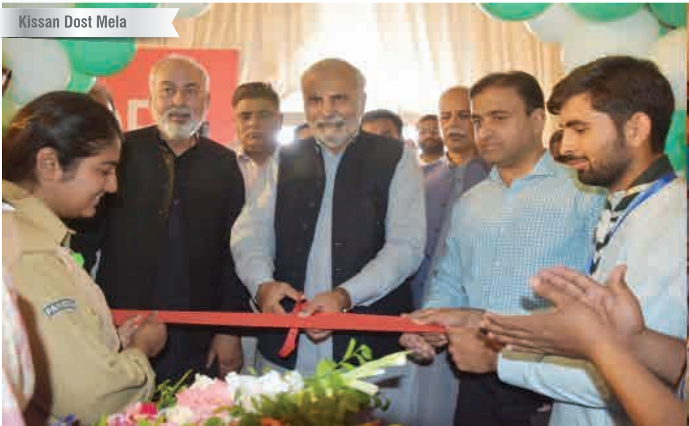
Kissan Dost Mela