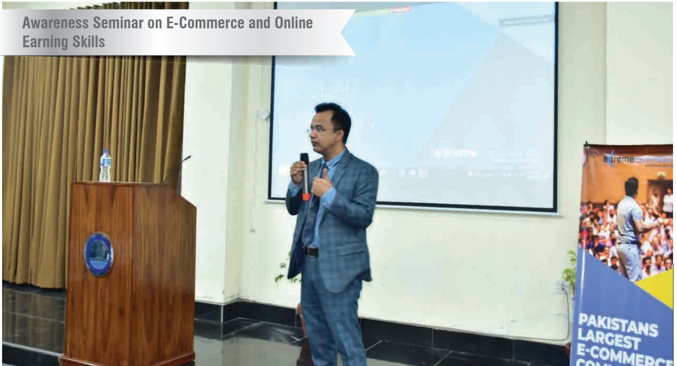
Awareness Seminar on E-Commerce and Online Earning Skills