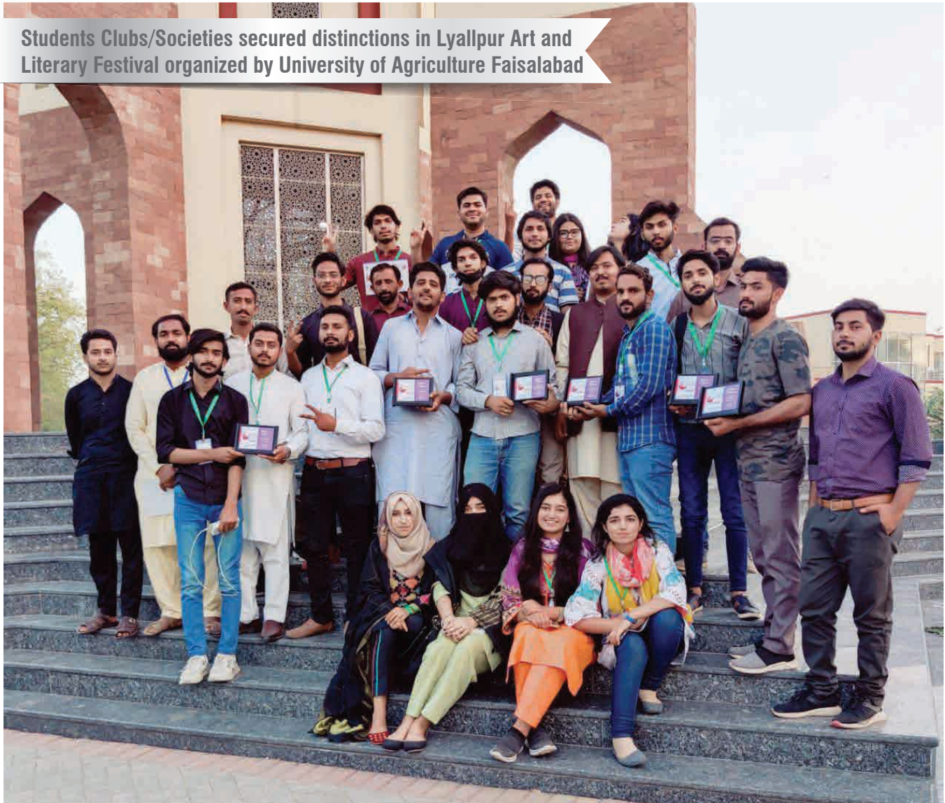
Students Clubs/Societies secured distinctions in Lyallpur Art and Literary Festival organized by University of Agriculture Faisalabad