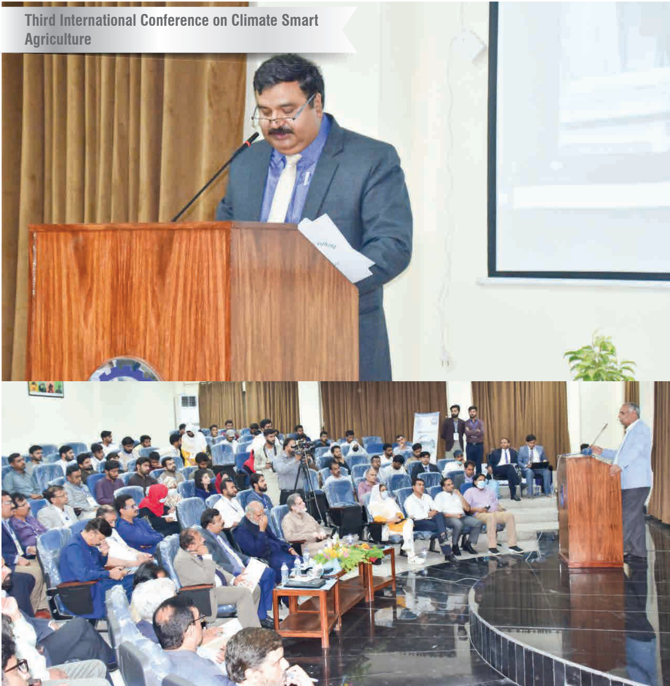
Third International Conference on Climate Smart Agriculture