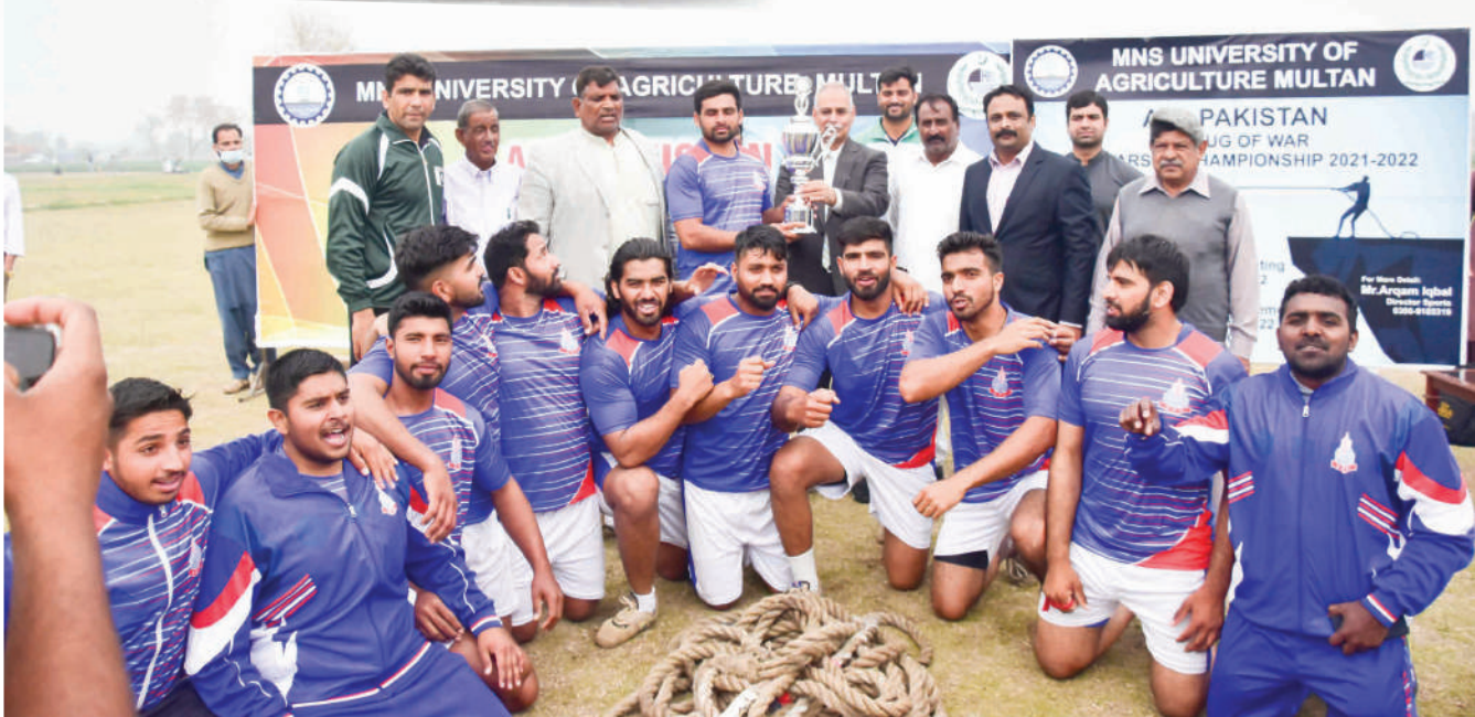
HEC All Pakistan Tug of War championship 2021-22