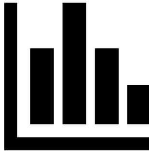
Figure 3.1: Give caption of figure (12 Font size)