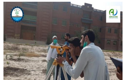
Agriculture Volunteers AV conducted Training Session of new Volunteers.