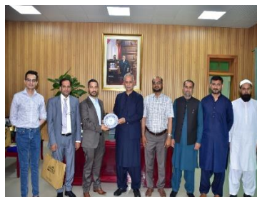
HEC Team at MNSUAM's BIC.