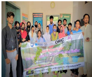
Little steps big impact tree Plantation