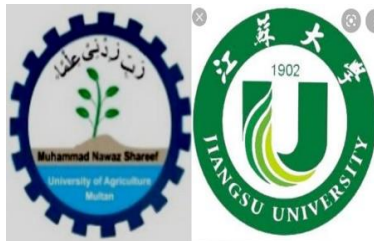
ORIC with Jiangsu University, Zhenjiang