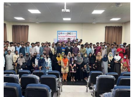
Uses and Abuses of Social Media and PECA 2022.