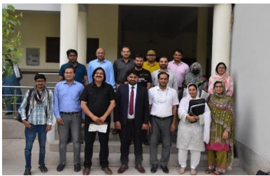
Entrepreneurship / Small Business Startup & Management