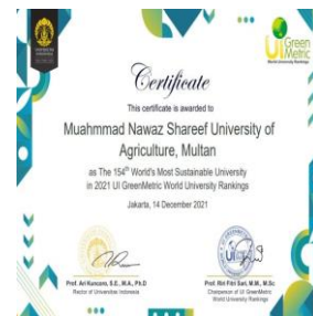
UI GreenMetric World University Ranking 2021