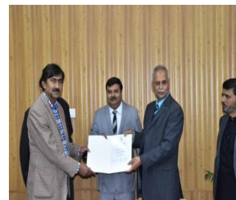
The pedagogical expert from Qatar University tendered "Training Workshop on Validating Ideas-A Systematic Approach"