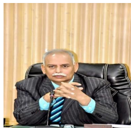
ORIC MNS University organized the first steering committee meeting