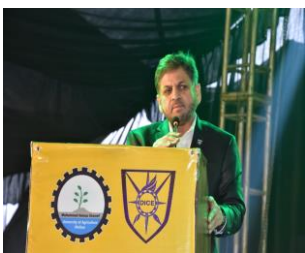
MNS University of Agricultural organized two days DICE competition