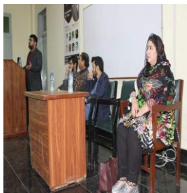
ORIC MNSUAM organized an Entrepreneurial mindset and summit of success.