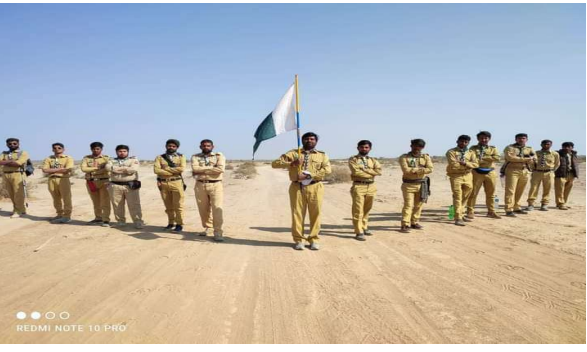
School, Kali Puli, Canal Colony, Bahawalpur. 13 Rovers also passed their Rambler Badge during this hike including 7 Rovers from Rover Scouts Unit, MNS-UAM. Closing ceremony was held at Derawar Fort on February 18, 2020.