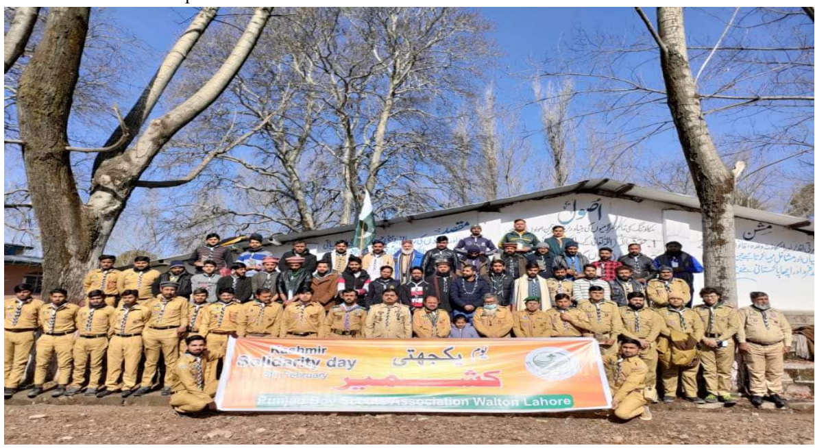
These all are celebrating the Kashmir day with full devotion and dedication. It is observed to show Pakistan Support and the unity with the people of Jammu & Kashmir.