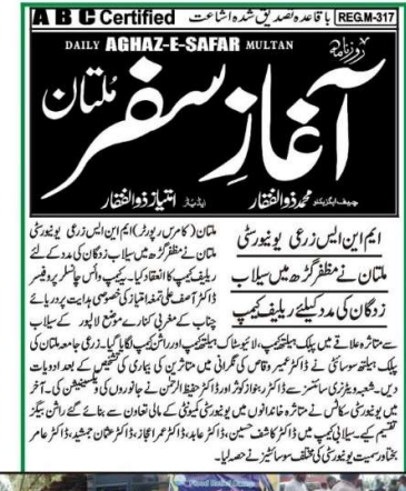
ملتان: ايم اين السرزرع يونيورش كي جانب عظر كرده عن سال ب زدگان كيليد ميذيك كريمي، وينزري كيب وريونيورش سكاوش ني راش تقتيم كيا

ماتان (شاف رپورٹر) زرعی بدخیرٹ ماتان سیاب عمائی خدمات انجام وینے والے 50 کا سے استان (ساف رپورٹر) کری بدخیر کے اسکاؤٹٹ قاصد کی اور فوقل پرس فاکروگئی ماتان بہترین رشا کاروں کو دیا گیا۔ رکس ماسعہ پروفیسر جھیرکو پرائم ششر عالم بیرائم ششر فلڈ ہیرو فوقل کی اظہار کرتے ہوئی کا اظہار کرتے ایجار وارد ہوئے کہا کہ ہماری بدخیرش کی طلبا وطالبات ایجاد وی کیا کہ ہماری بدخیرش فیش دیر جدیں۔