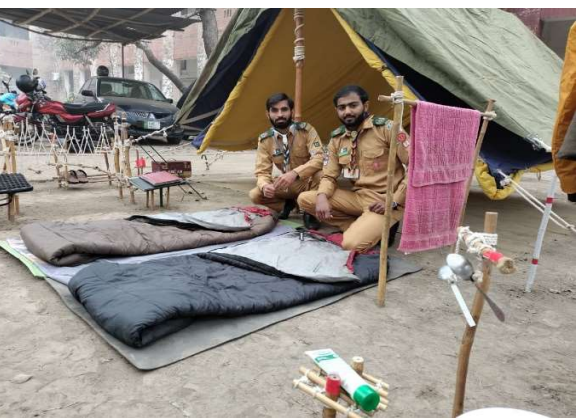
Page 26 of 26